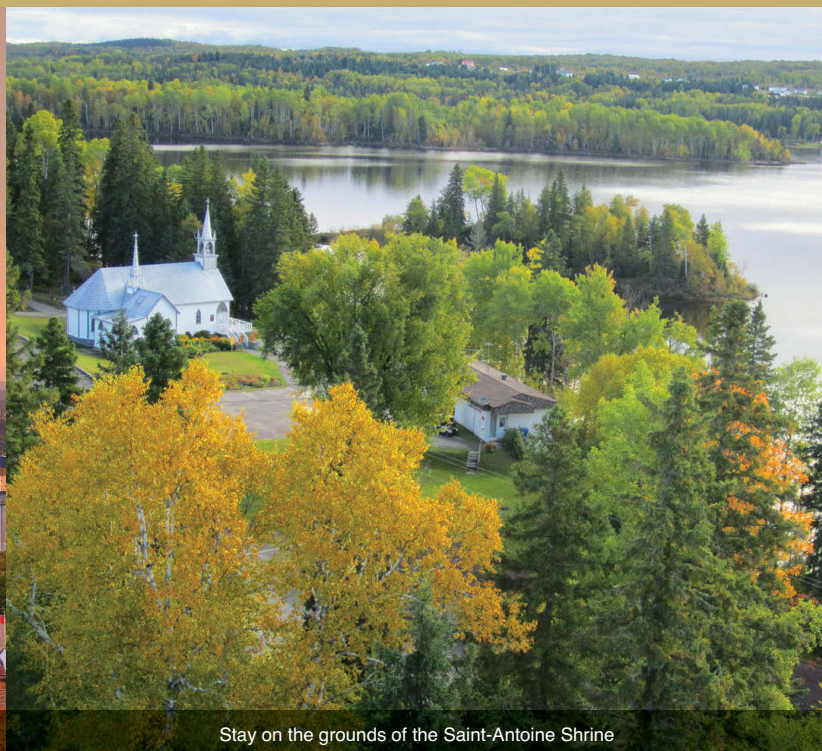
Stay on the grounds of the Saint-Antoine Shrine

North America. Continuing on, we arrive at Manor Montmorency, once the summer home of the Duke of Kent for a breathtaking view of Montmorency Falls. Higher than Niagara, Montmorency is Eastern Canada's highest waterfall. In the heart of Quebec sits Basilica-Cathedral Note-Dame de Quebec, a UNESCO World Heritage Site.