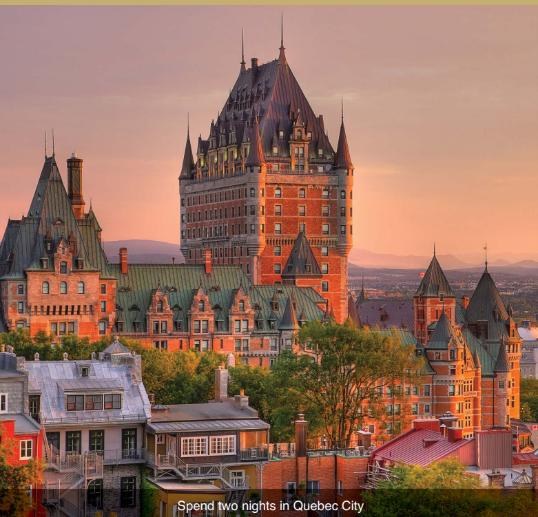
Spend two nights in Quebec City