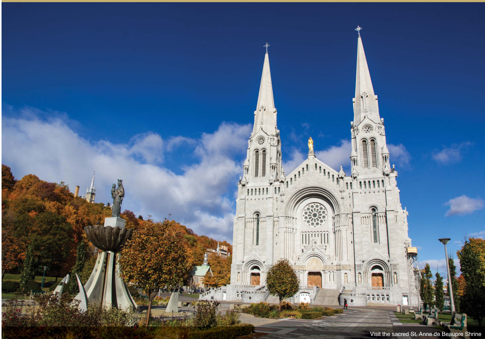
Visit the sacred St. Anne de Beaufre Shrine