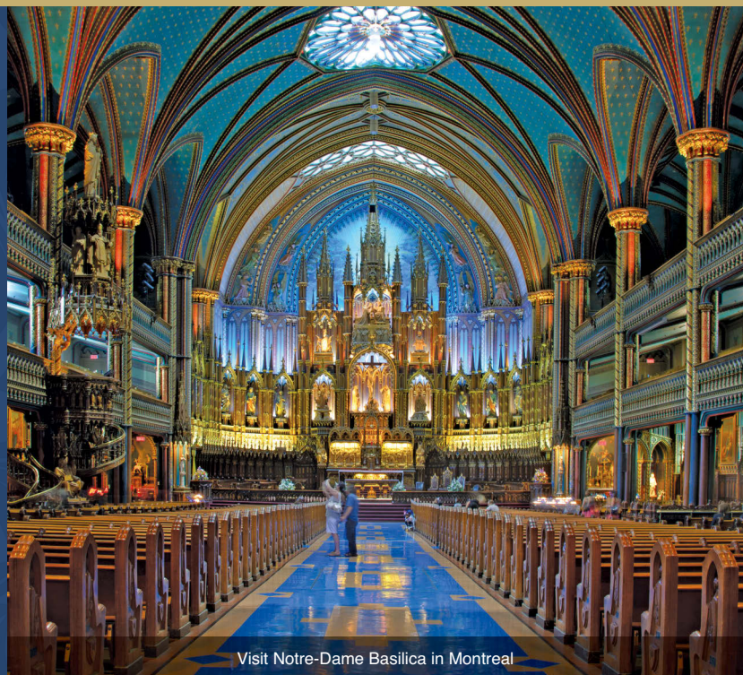
Visit Notre-Dame Basilica in Montreal

Days One and Two – Gouverneur Hotel Place Dupuis, Montreal, Quebec Days Three and Four – Hotel Chateau Laurier, Quebec City, Quebec Days Five and Six – Ermitage Saint-Antoine, Lac-Bouchette, Quebec Day Seven – Gouverneur Hotel, Trois-Rivieres, Quebec