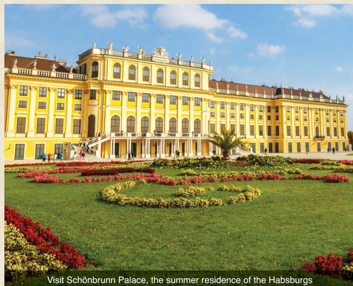
Visit Schönbrunn Palace, the summer residence of the Habsburgs