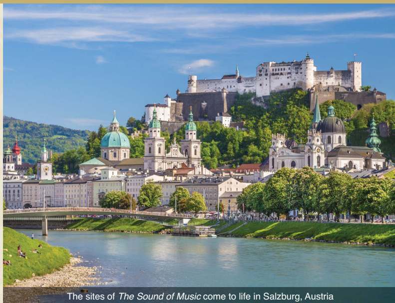
The sites of The Sound of Music come to life in Salzburg, Austria

Ludwig' as you explore the interior of this amazing castle. Stunning views of the surrounding countryside await as you peer from the portals of the castle. After the visit, you'll be transferred back down the hill, and continue your journey to Salzburg for 3-nights' accommodations. Meal: B