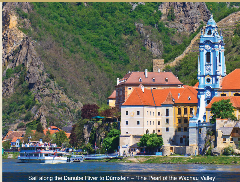
Sail along the Danube River to Dürnstein – 'The Pearl of the Wachau Valley'

Departing Salzburg, today's adventure unfolds with the exploration of the sites and cities of the Danube Valley. Enroute to Vienna, visit the famed Melk Abbey, a UNESCO World Heritage Site, majestically towering over the Danube River. The Abbey provides a sweeping panorama of the Lower Alps and is one of the most significant Baroque-style building complexes in Europe. During the guided visit, see the Marble Hall and the Library with thousands of identically bound books. The highlight of the visit will be the Abbey Church, regarded as the most beautiful church in the world. There's no better way to experience the Danube Valley than on a boat ride between Krems and Dürnstein. Remarkable scenery awaits! Following the cruise, re-board the coach and continue to Vienna. Meal: B