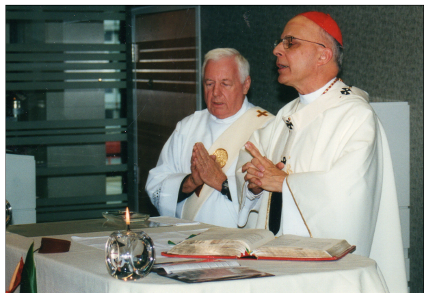
Celebrating Mass with Francis Cardinal George