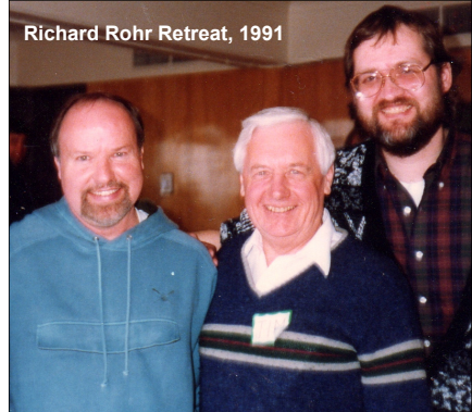
Richard Rohr Retreat, 1991