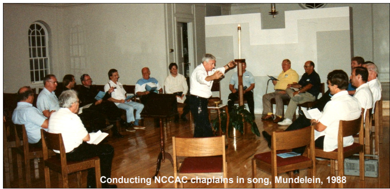
Conducting NCCAC chaplains in song, Mundelein, 1988