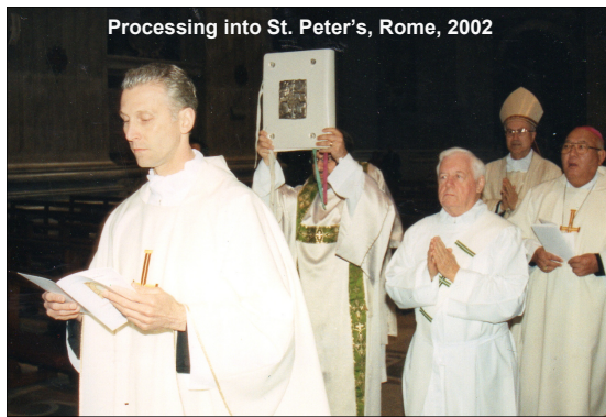
Processing into St. Peter's, Rome, 2002