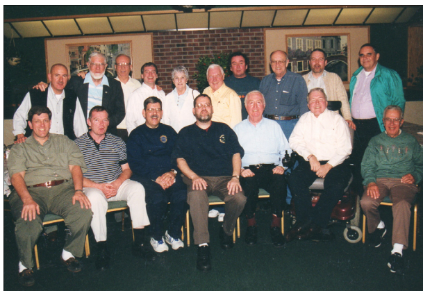
NCCAC at North Palm Beach, 2001