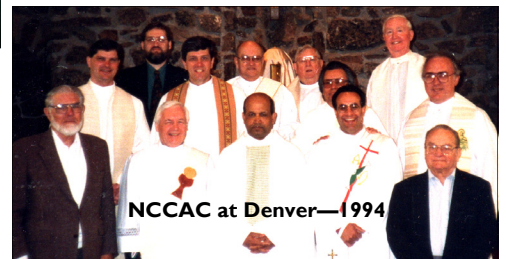
NCCAC at Denver—1994