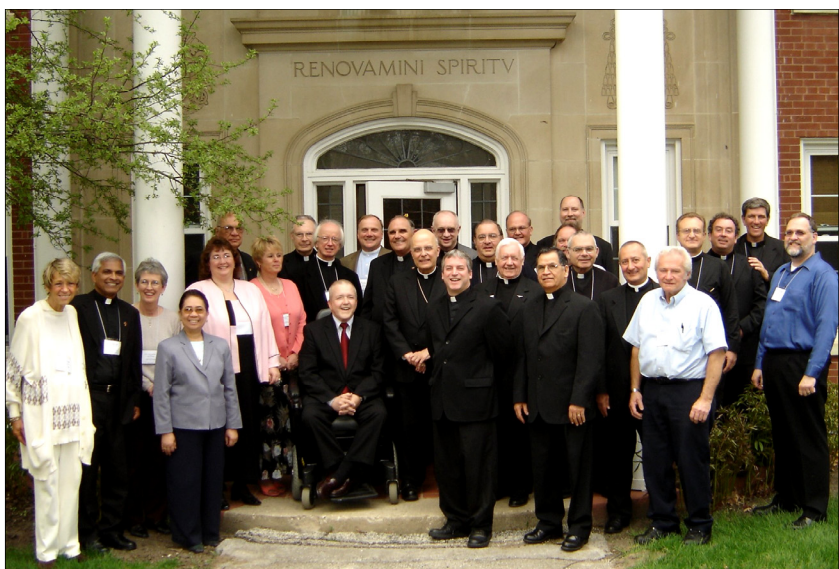
NCCAC gathering at Mundelein Retreat House with Cardinal George, 2006