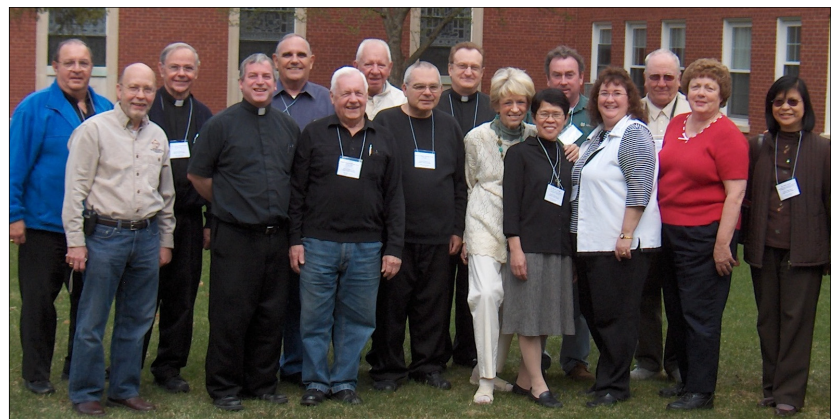
NCCAC at Mundelein—2013